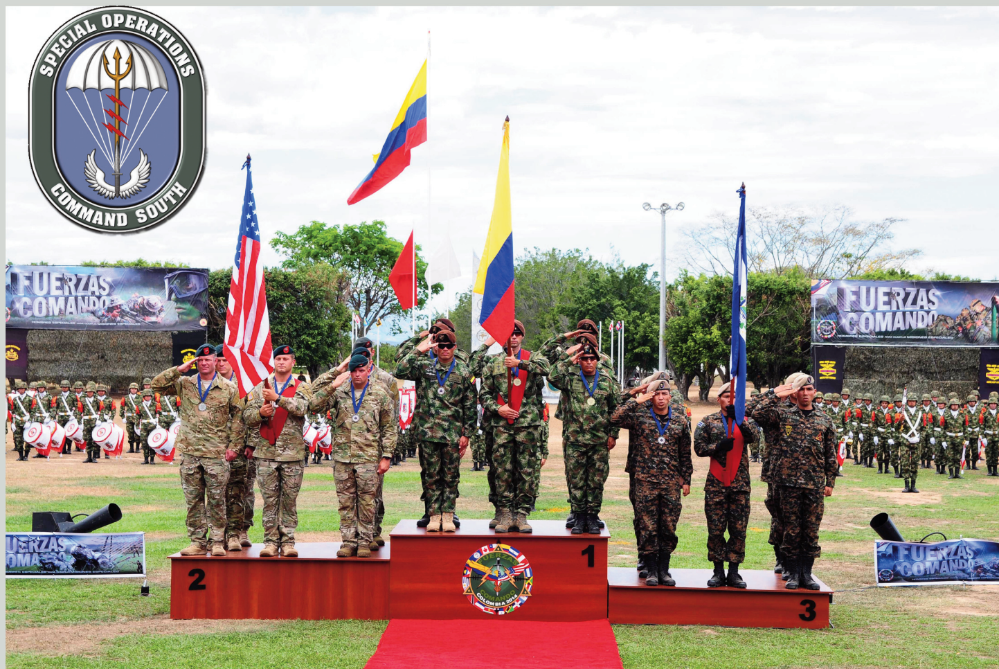
The top three teams of the Fuerzas Comando competition salute during the closing ceremony July 31 on the parade field in Fort Tolemaida, Colombia. For the sixth time in 10 years, the team from the Republic of Colombia wins the title of Fuerzas Comando. The U.S. team, comprised of members assigned to the 7th Special Forces Group (Airborne), placed second and El Salvador was third.