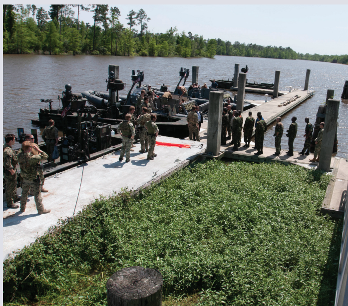
Students prepare for a demonstration of the Special Operations Craft-Riverine. Part of the NAVSCIATTS curriculum includes familiarization with select U.S. Special Operations capability.

On the night of Feb. 12, 2013, President Barack Obama stepped into the House Chamber of the U.S. Capitol to deliver his State of the Union Address. In front of Congress and the country, the commander-in-chief opened his address and noted the bravery of American troops almost immediately. About 40 minutes into his speech, the president returned to the topic,