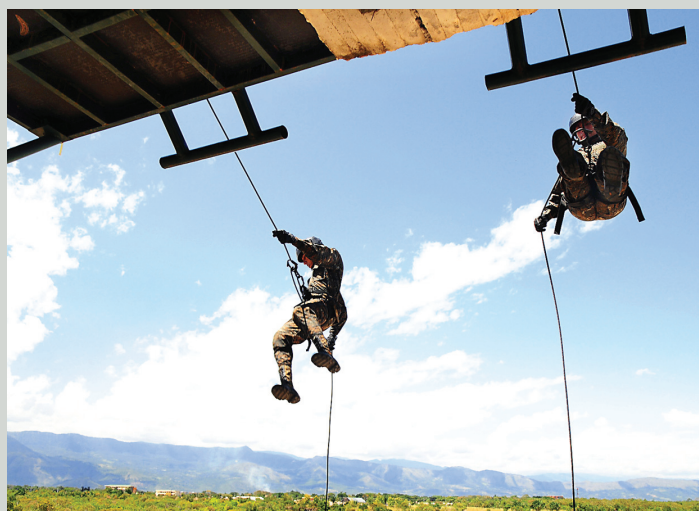
Two members of the Guatemalan team slide down a 30-foot tower during the stress event portion at Fuerzas Comando 2014.