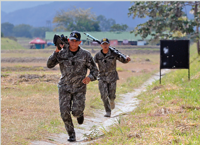
Snipers from Peru run more than 800 meters before firing their rifles during the FBI “T” shoot event July 24.