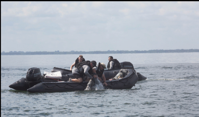
Safety crew pulls in swimmer.