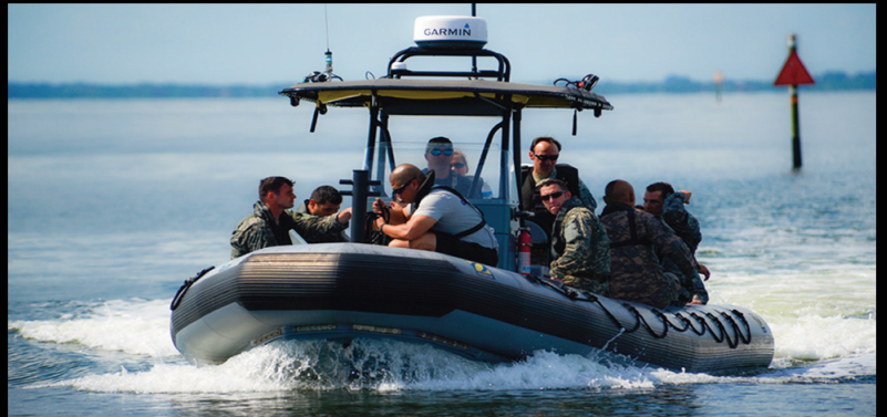
Return to base.