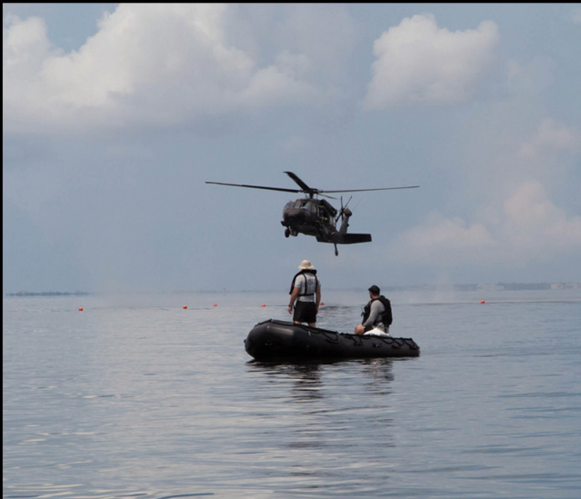
Helocast inbound.