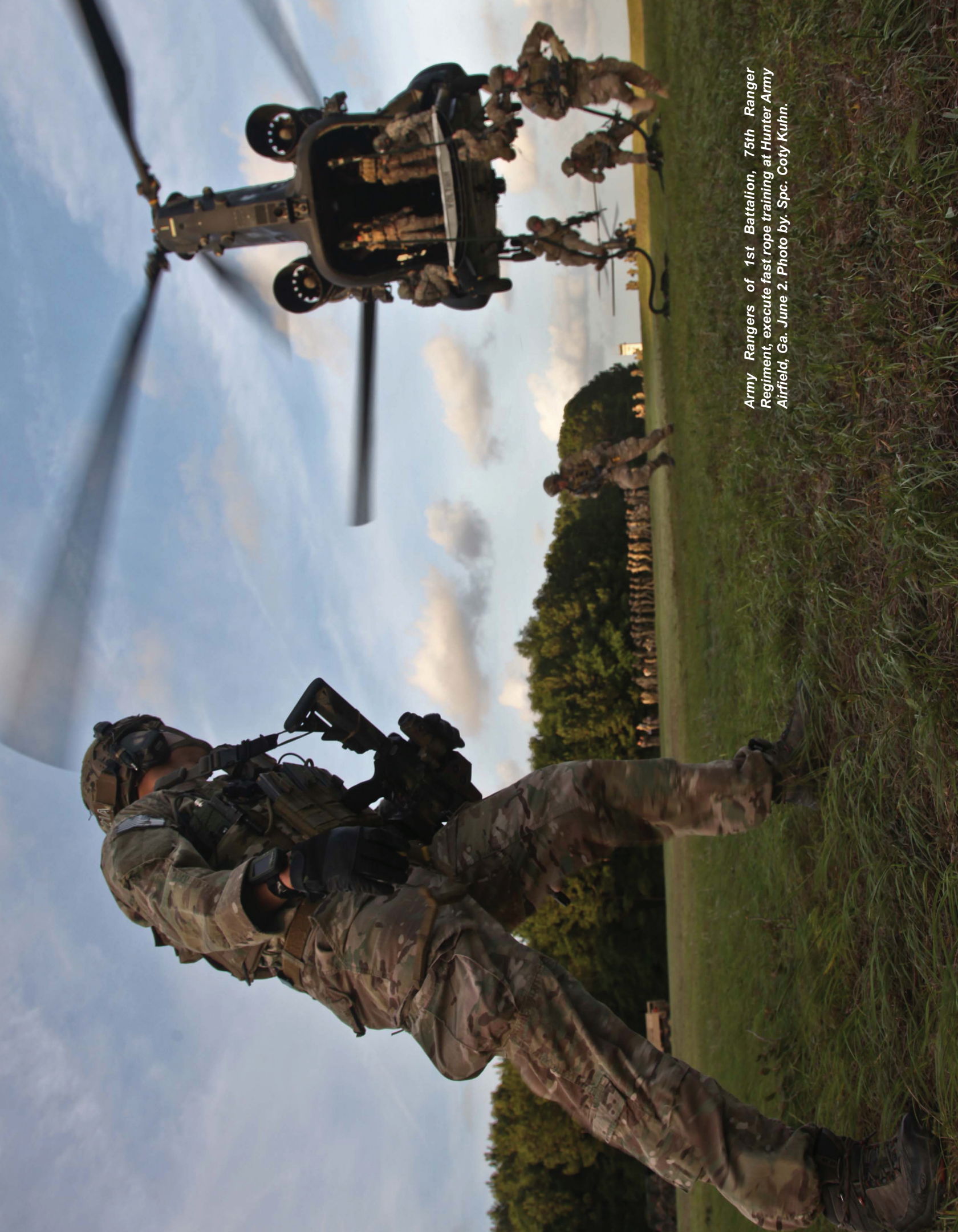
Army Rangers of 1st Battalion, 75th Ranger Regiment, execute fast rope training at Hunter Army Airfield, Ga. June 2.