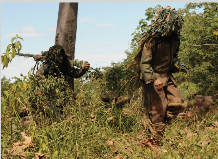
The El Salvador special operations sniper team heads into a woodline to finish concealing themselves in the sniper stalk, July 26.