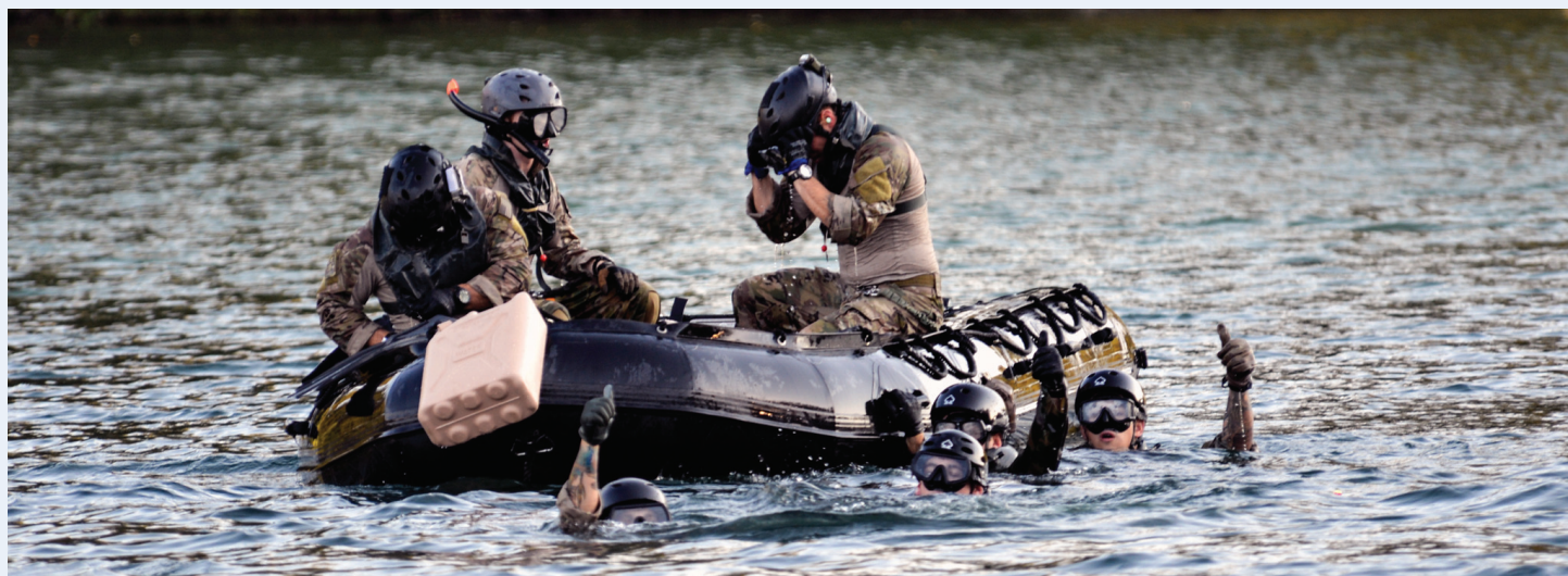
Airmen from the 22nd Special Tactics Squadron's Red Team give Soldiers in an MH-47 Chinook helicopter the thumbs up July 14, to let them know they were fully accounted for in the water of American Lake on Joint Base Lewis-McChord, Wash. The Airmen practiced soft duck operations which involve them pushing an inflated zodiac boat out of the back of the helicopter as they jump in after it.

This exercise proved, once again, that Soldiers and Airmen from Joint Base Lewis-McChord can train together, fight together and run a base together.