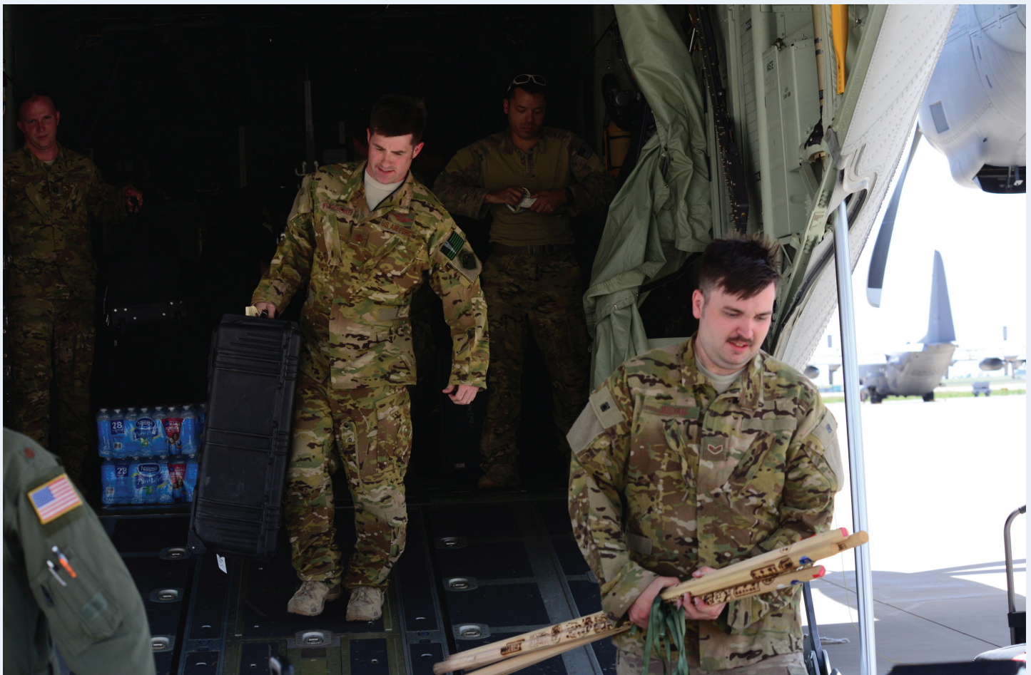
Aircrew from the 522nd Special Operations Squadron unload supplies, souvenirs, and luggage down the ramp of an MC-130J Commando II that just completed a mission around the globe July 9, at Cannon Air Force Base, N.M. The mission spanned five continents and took nearly four weeks to complete.

The true triumph of the mission, according to Jones, is the teamwork it took for units from the 27th Special