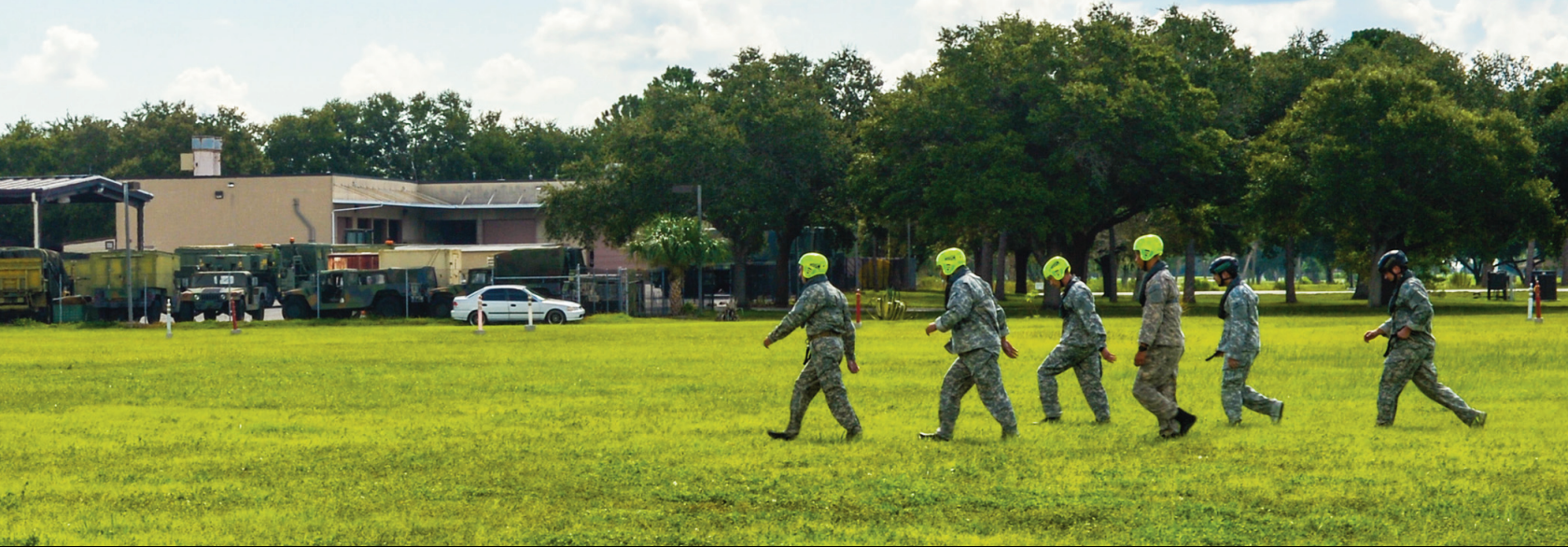
Preparing to board.