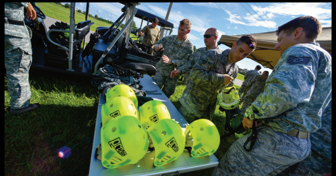
Picking up safety gear.