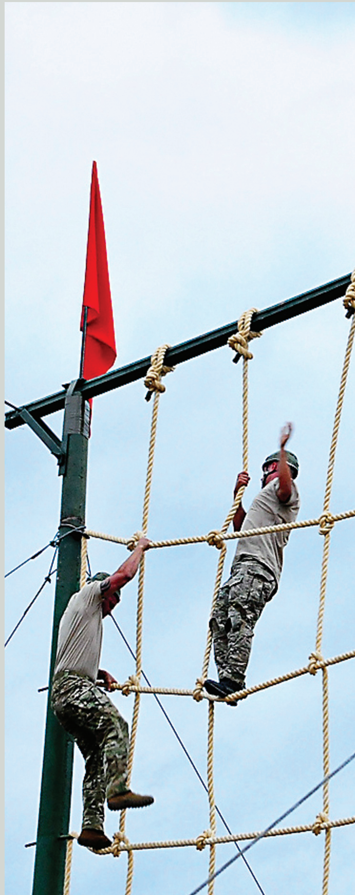
Special operators from 7th Special Forces Group (Airborne) participate in an obstacle course event during the Fuerzas Comando competition at Fort Tolomaida in Melgar, Colombia July 29.