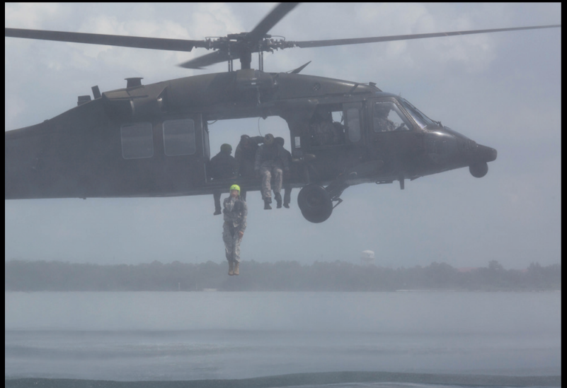
Egress.