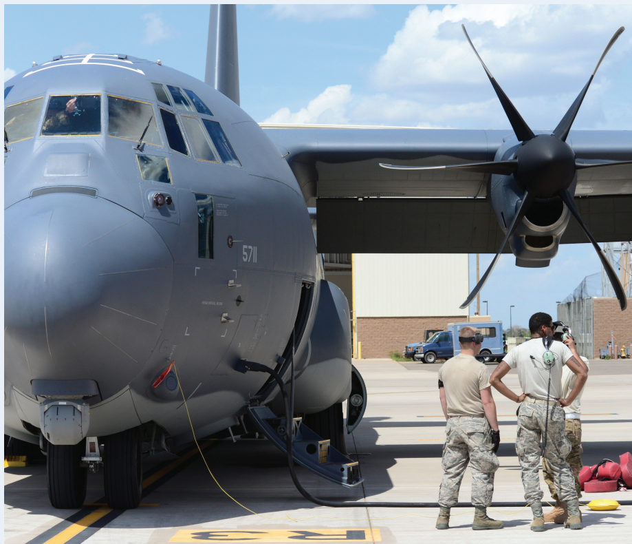
U.S. Air Force MC-130J Commando II maintainers gather to welcome the aircraft and its crew home from a nearly four-week mission around the world July 9, at Cannon Air Force Base, N.M. The mission was the first of its kind for Air Force Special Operations’ newest aircraft.

“We got to see and do some amazing things, but the