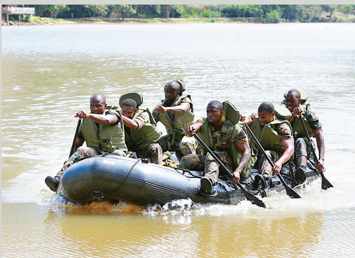
Members of the Jamaica special operations team row their raft across Lake Pastrana, Colombia, to get to the next station of the Fuerzas Comando aquatics event, July 27.