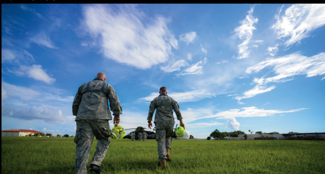
Walking to the Blackhawk.