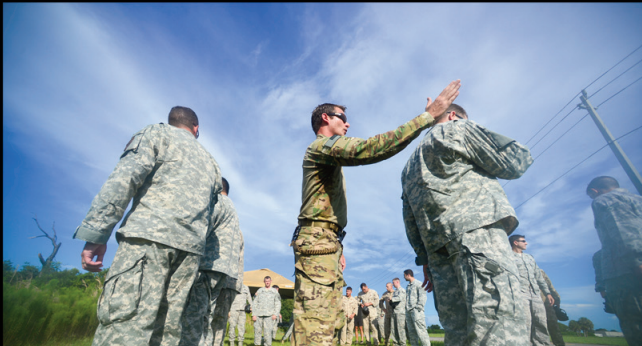
Receiving instruction.

An airborne technique used by small unit, Special Operations Forces to insert into a military area of operations. Members of USSOCOM headquarters practiced this Special Operations technique July 10.