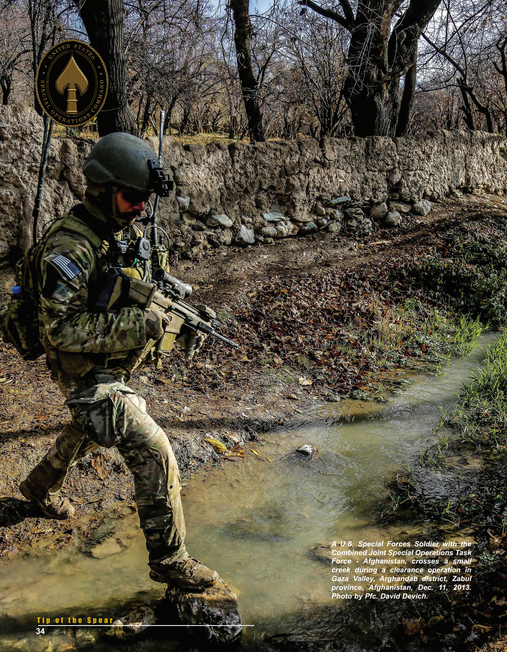
A U.S. Special Forces Soldier with the Combined Joint Special Operations Task Force - Afghanistan, crosses a small creek during a clearance operation in Gaza Valley, Arghandab district, Zabul province, Afghanistan, Dec. 11, 2013.