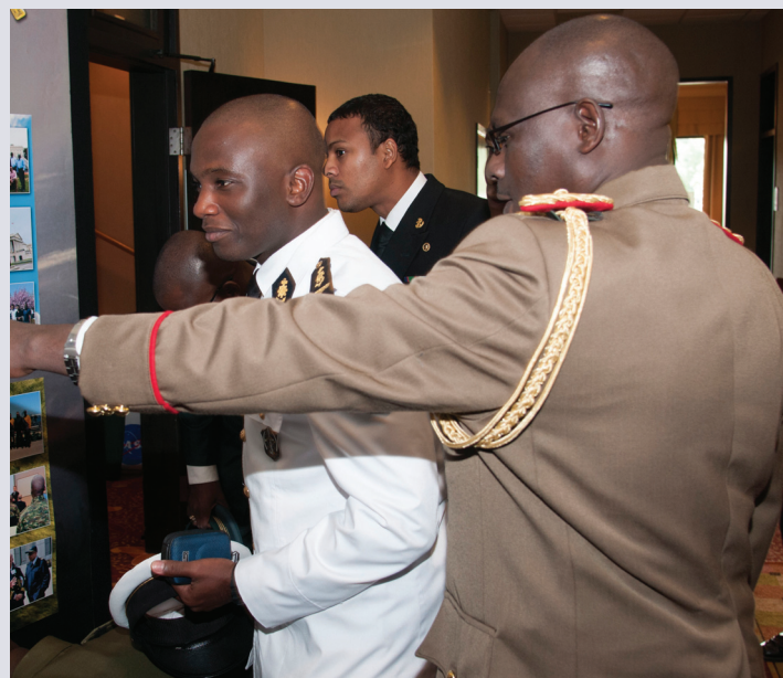
NAVSCIATTS students look at photos from a class trip to Washington, D.C., before their graduation ceremony at Diamond Head Country Club in Diamond Head, Miss. The class visited the U.S. Capitol building and other historic landmarks during the trip, which is designed to expose students to various aspects of American culture.